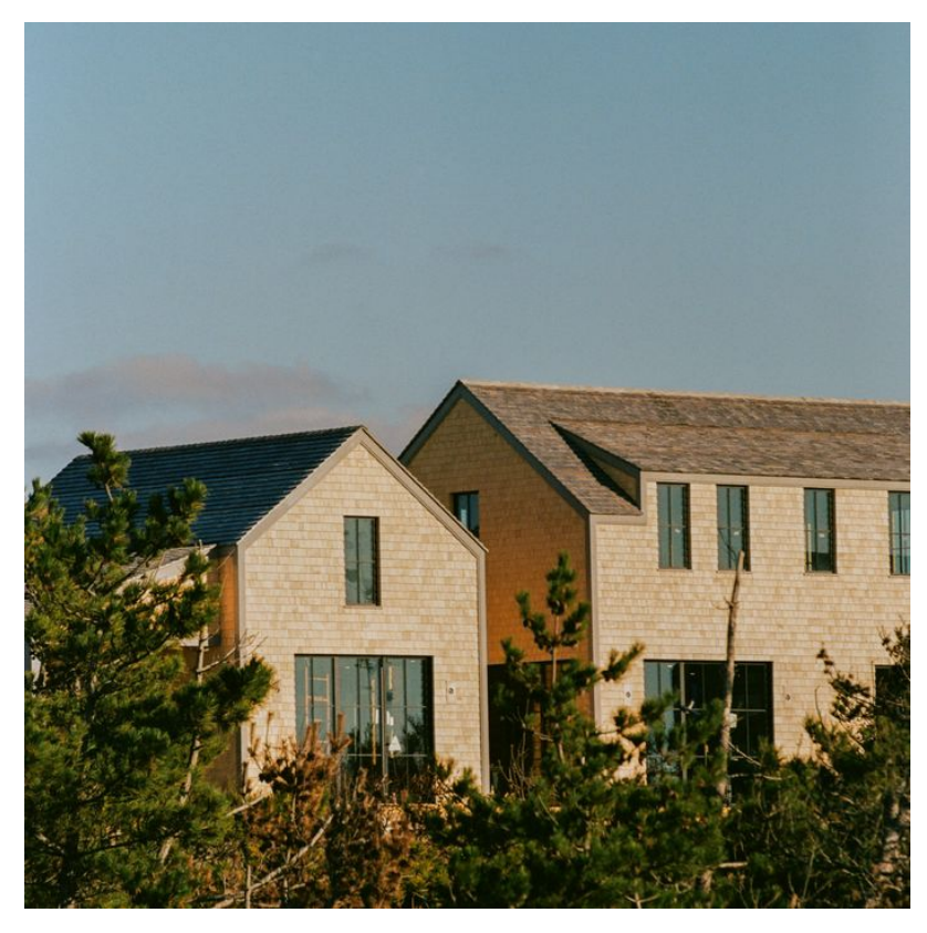
The only property available on Nantucket for less than $1 million, as of Nov. 10, was an empty lot for $900,000.

The goal may be realized a bit faster in Vail, where more than 14% of the city's dwelling units are covered by deed restrictions, with many more to come. In a community such as Vail, Ruther says, "increases in property values will continue to outpace wages. So there will always be a need for deed-restricted housing."