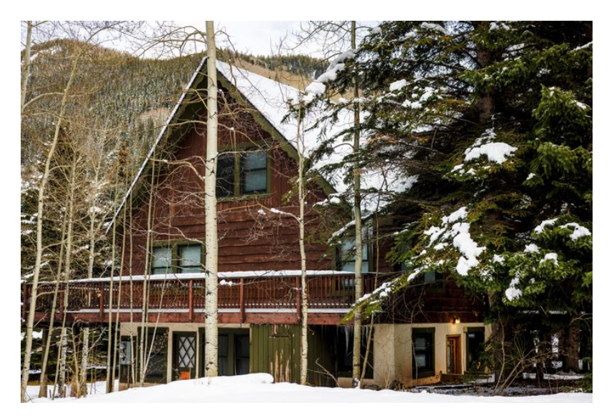
The town of Vail bought this house with a separate apartment on Black Gore Drive for over $2 million. It houses municipal workers. The town may eventually build more workforce housing on the property.

"We saw the need, and we feel we did the right thing," she says.