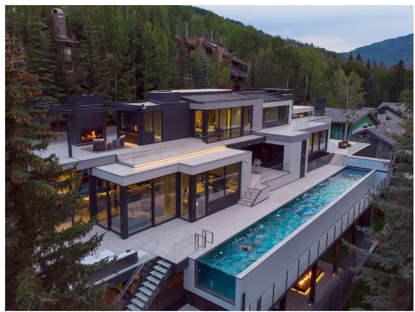
Berglund designed a 9,000-square-foot spec house that is listed for just under $40 million. Its features include a 75-foot glass-bottom swimming pool, a spa with waterfall, a screening room, a 'car rinse' in the garage, nine bathrooms and over 6,500 square feet of heated outdoor terraces.

People who have jobs on Nantucket but who can't find housing there commute each day by ferry from Cape Cod, a voyage that can take over two hours one way, with additional travel at both ends. FedEx and UPS employees commute by air while one local store, the Marine Home Center, has two planes for shuttling workers back and forth from Hyannis, on Cape Cod, a 10- to 15-minute flight. About 30 to 40 people fly over in two shifts every morning.