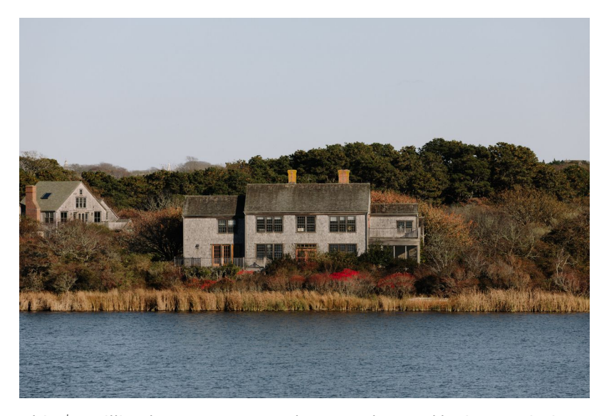
This $5 million house on Nantucket was doomed by its proximity to scenic Hummock Pond. To improve access to the pond, the Nantucket Land Bank plans to tear it down.

Ruther's aggressive approach to the problem has recently included spending $7 million of the town's money to buy three oddly shaped parcels from the Colorado Department of Transportation, after making the case that they would never be needed for roads. He expects the town to eventually develop worker housing on the properties.