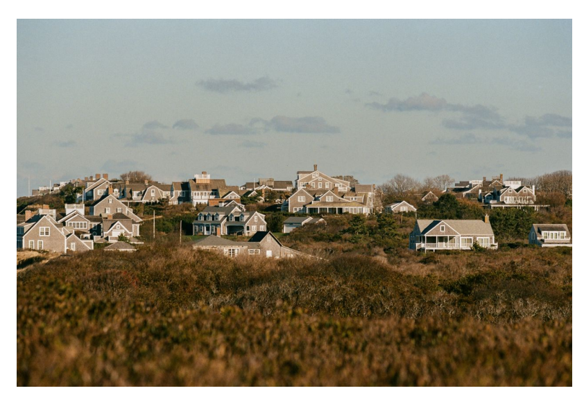
Nantucket's population swells during the summer months.

Trust, founded in 2009, receives less than one-fifth as much money from the town as the Land Bank gets from its real-estate transfer tax. But the town has voted to impose a separate transfer tax to fund affordable housing and is waiting for the Massachusetts legislature to approve it.