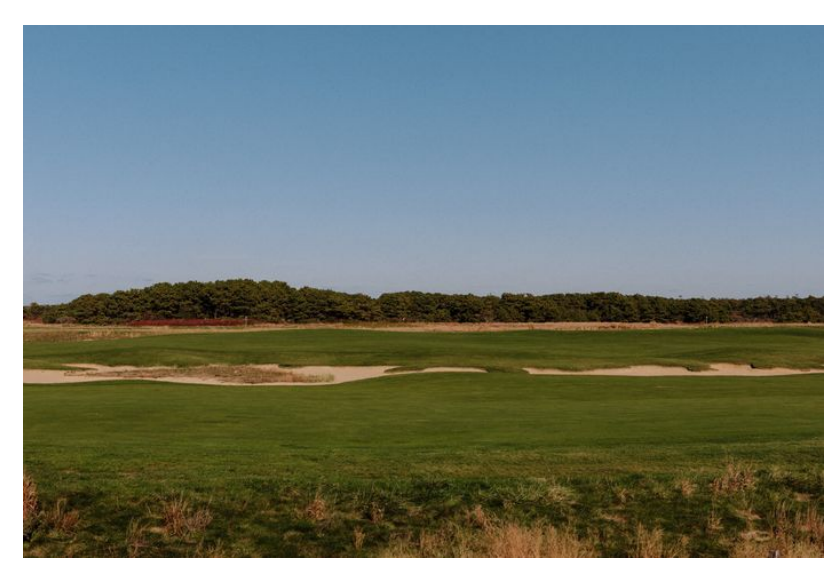
The Miacomet Golf Course on Nantucket is owned by the Nantucket Land Bank, which is charged with aiding conservation, outdoor recreation and agriculture on the island.

worker housing, it bought an eight-bedroom duplex near the course for $2.9 million to house golf course employees. The purchase raised more than a few eyebrows, given that the Land Bank's commissioners "have long emphasized that they are not permitted to use Land Bank funds for housing initiatives," Jason Graziadei, who has been reporting on island affairs for nearly 20 years, wrote in the Nantucket Current, a local news website. Bell defended the purchases as "germane to the recreational component of our mission."